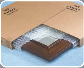
Telescoping mirror carton